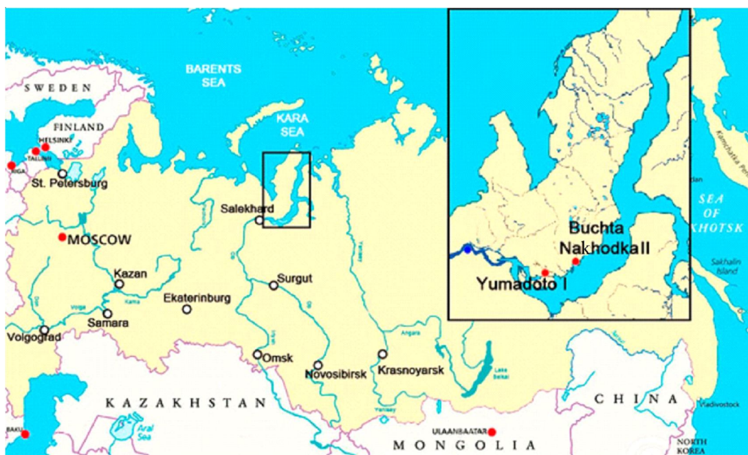
Fig. 1. Location of the burial grounds of Buchta Nakhodka 2 and Yumadoto 1

One male and three female skulls from the burials of the Buchta Nakhodka 2 burial ground, as well as one male and one female skull from Yumadoto 1 burial ground, were analyzed by